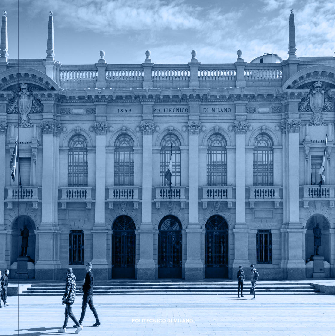
POLITECNICO DI MILANO

The university Professor is a teacher who carries out research and teaching activities in the field of academic education. Teaching, research and collaboration with companies and institutions are the main objectives of the Politecnico di Milano Professors.